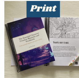
The Essential Character Creation Blueprint and Workbook - Print