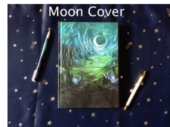
The Writer's Epiphany Notebook - Moon Cover

Get inspired to write even when you've had a hard day with: