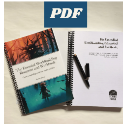
The Essential Worldbuilding Blueprint and Workbook - Printable PDF