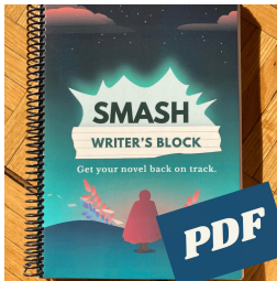
Smash Writer's Block Prompt Book - PDF Digital Download